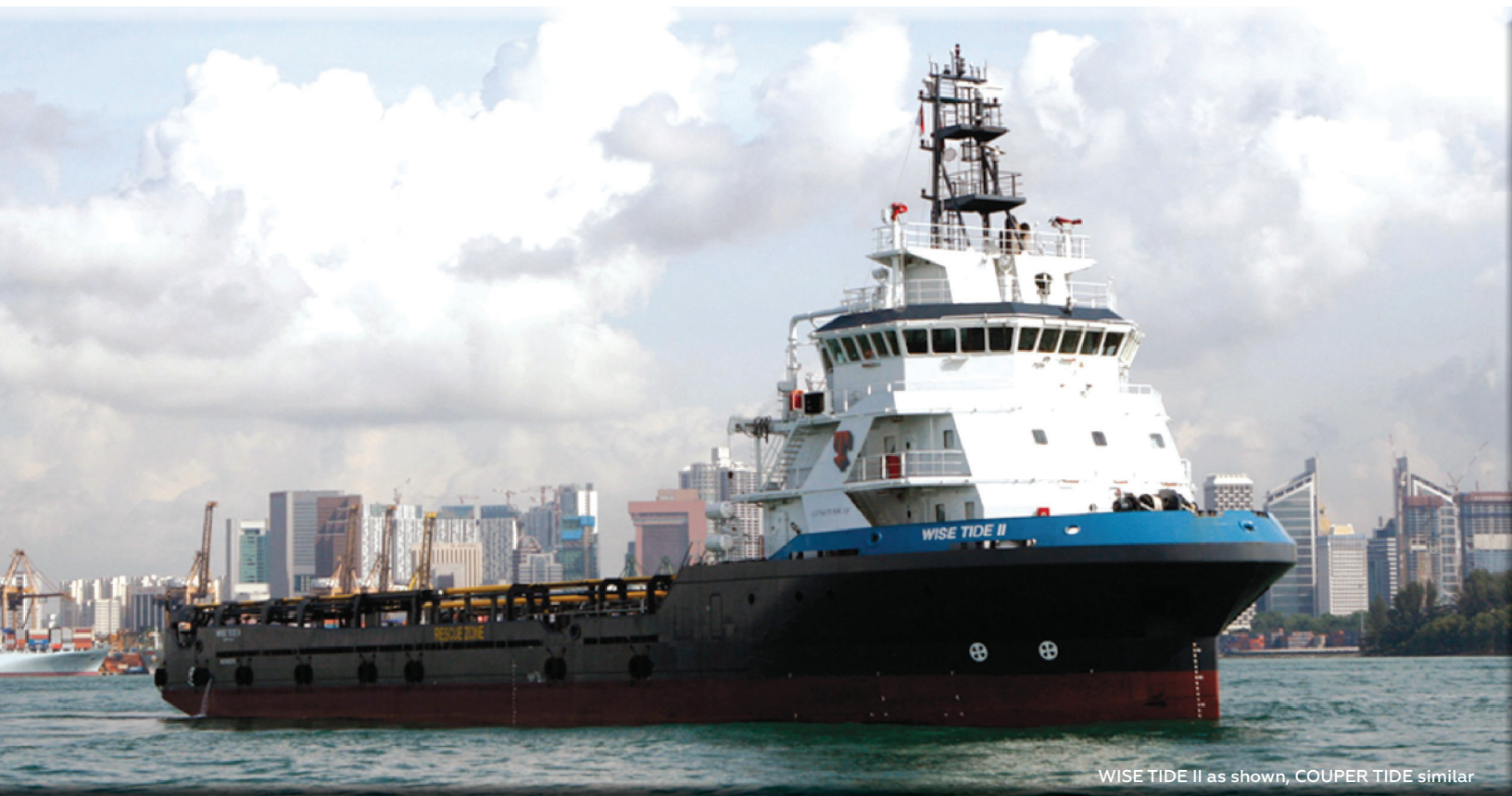
WISE TIDE II as shown, COUPER TIDE similar