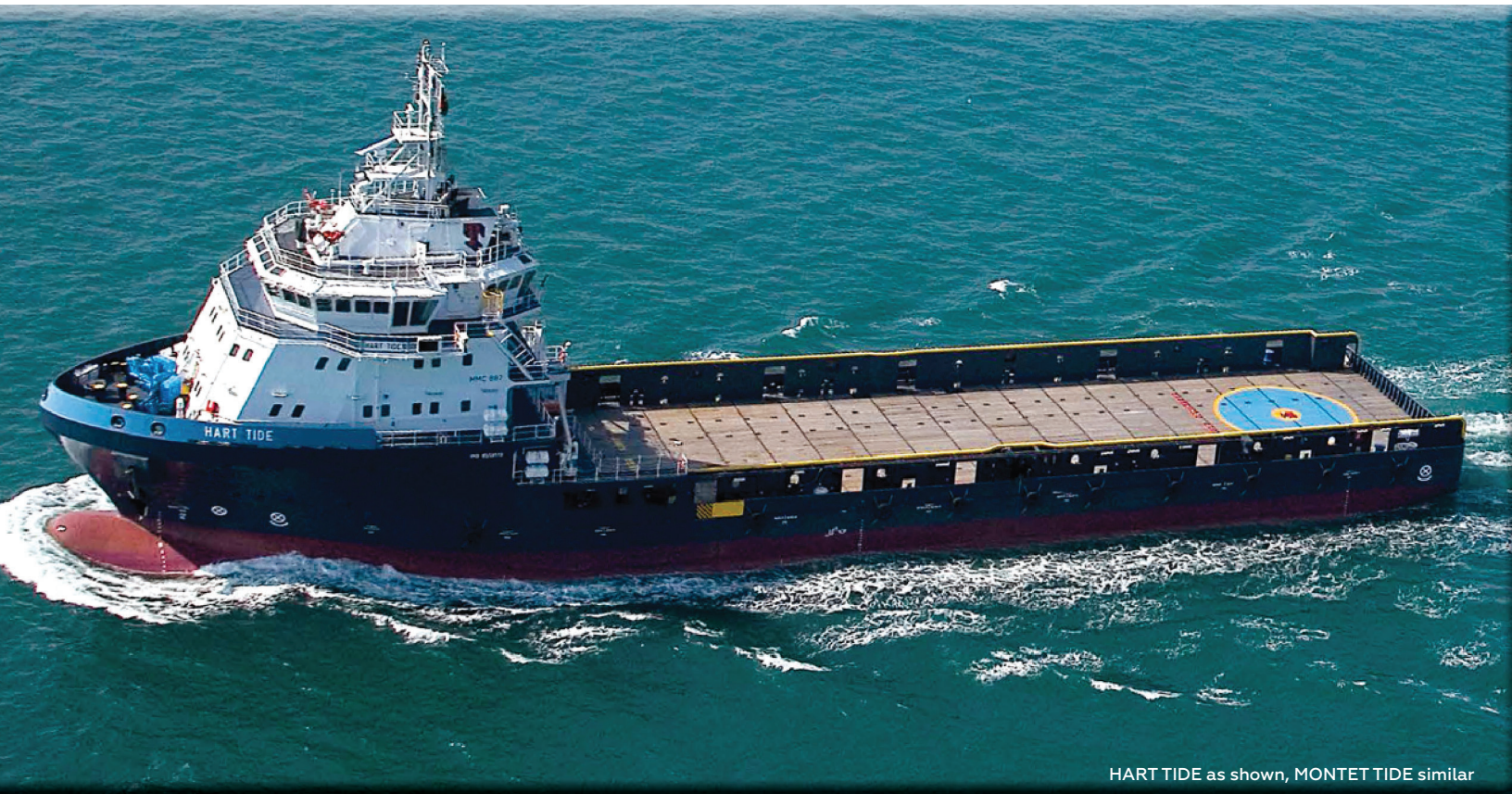
HART TIDE as shown, MONTET TIDE similar