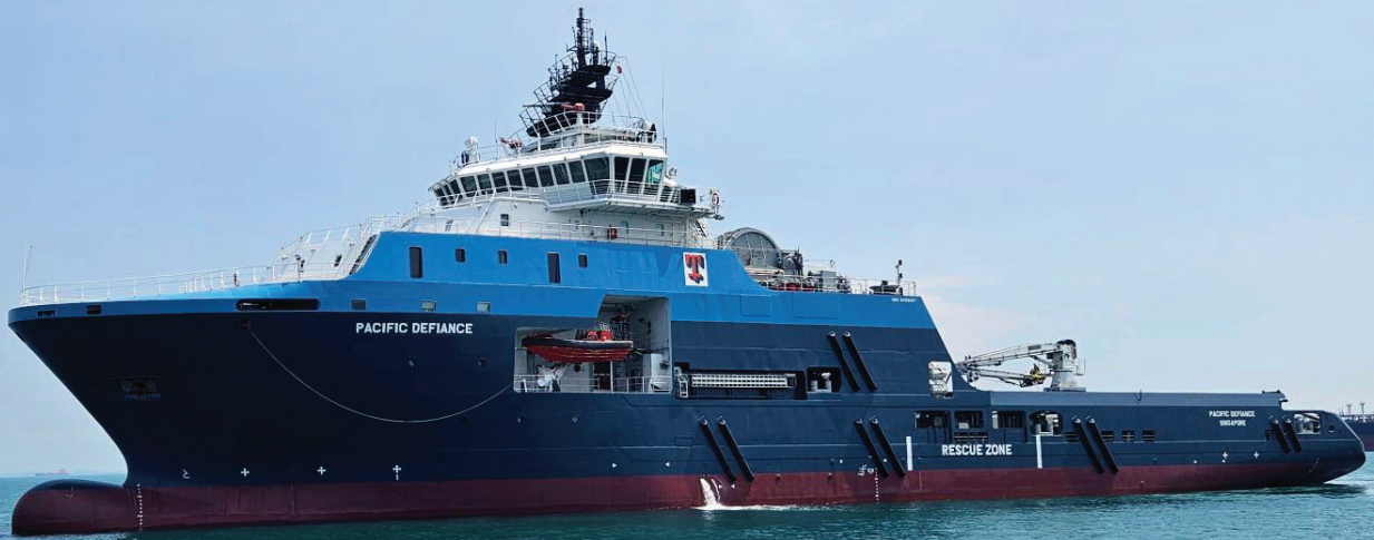
PACIFIC DEFIANCE as shown, PACIFIC DOLPHIN similar