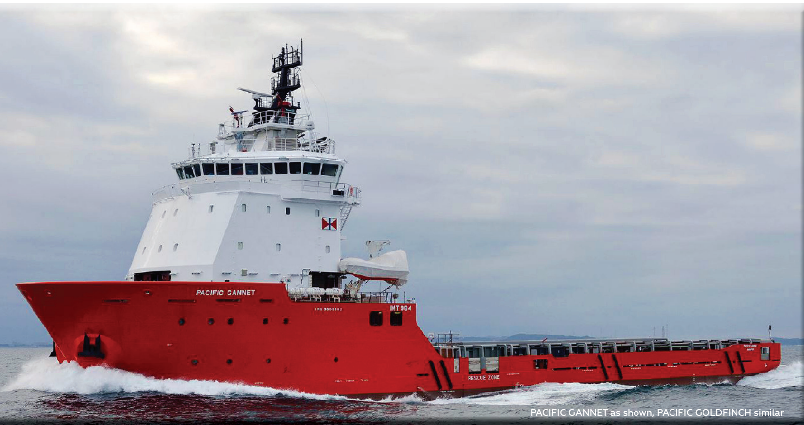
PACIFIC GANNET as shown, PACIFIC GOLDFINCH similar