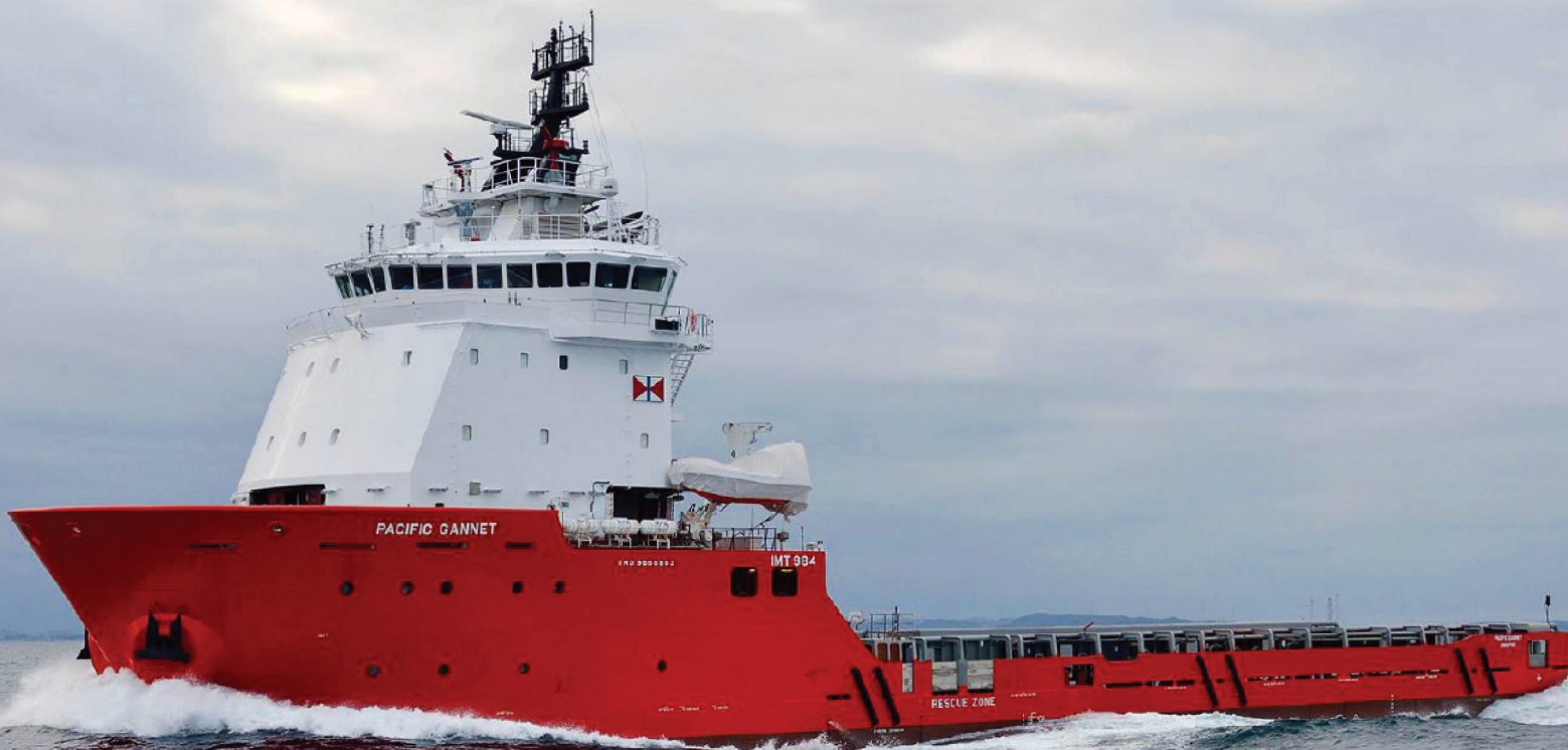
PACIFIC GANNET as shown, PACIFIC GROUSE similar