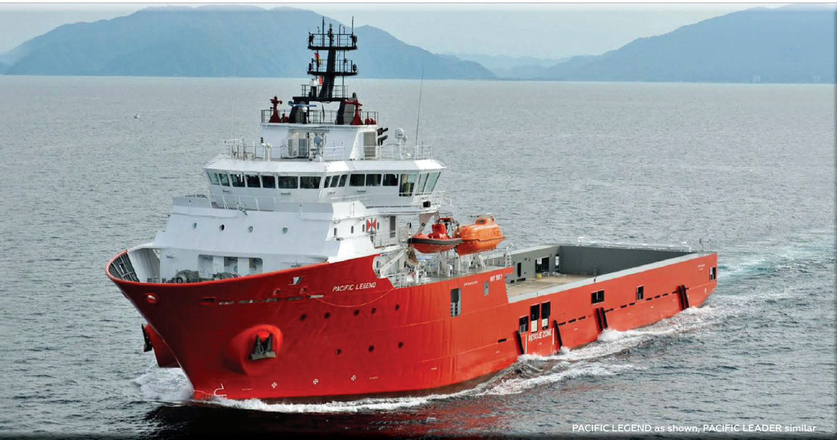
PACIFIC LEGEND as shown, PACIFIC LEADER similar