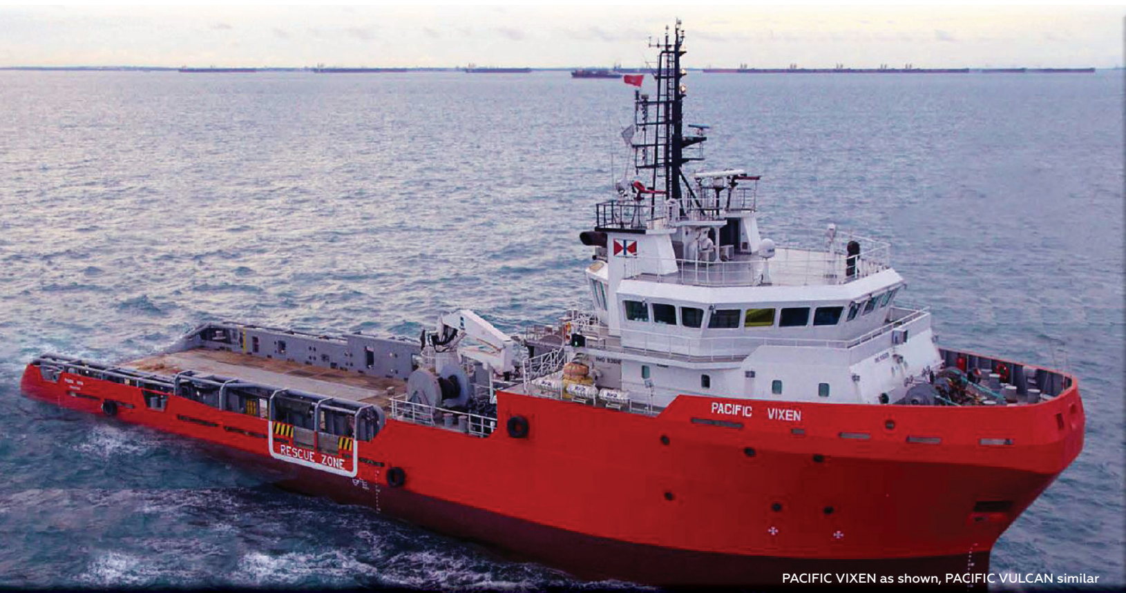
PACIFIC VIXEN as shown, PACIFIC VULCAN similar