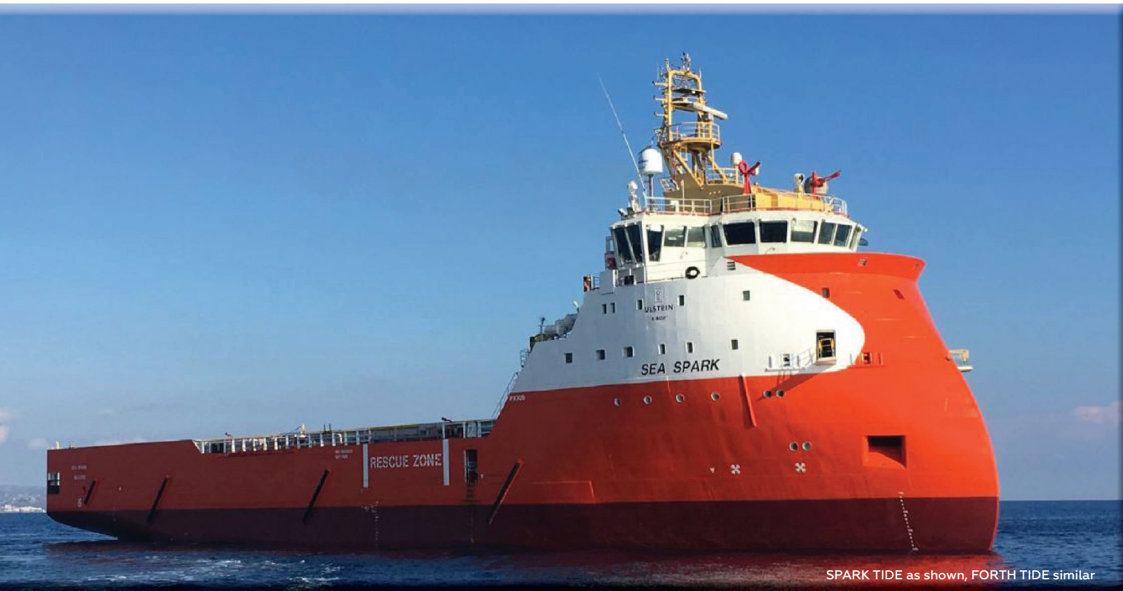
SPARK TIDE as shown, FORTH TIDE similar