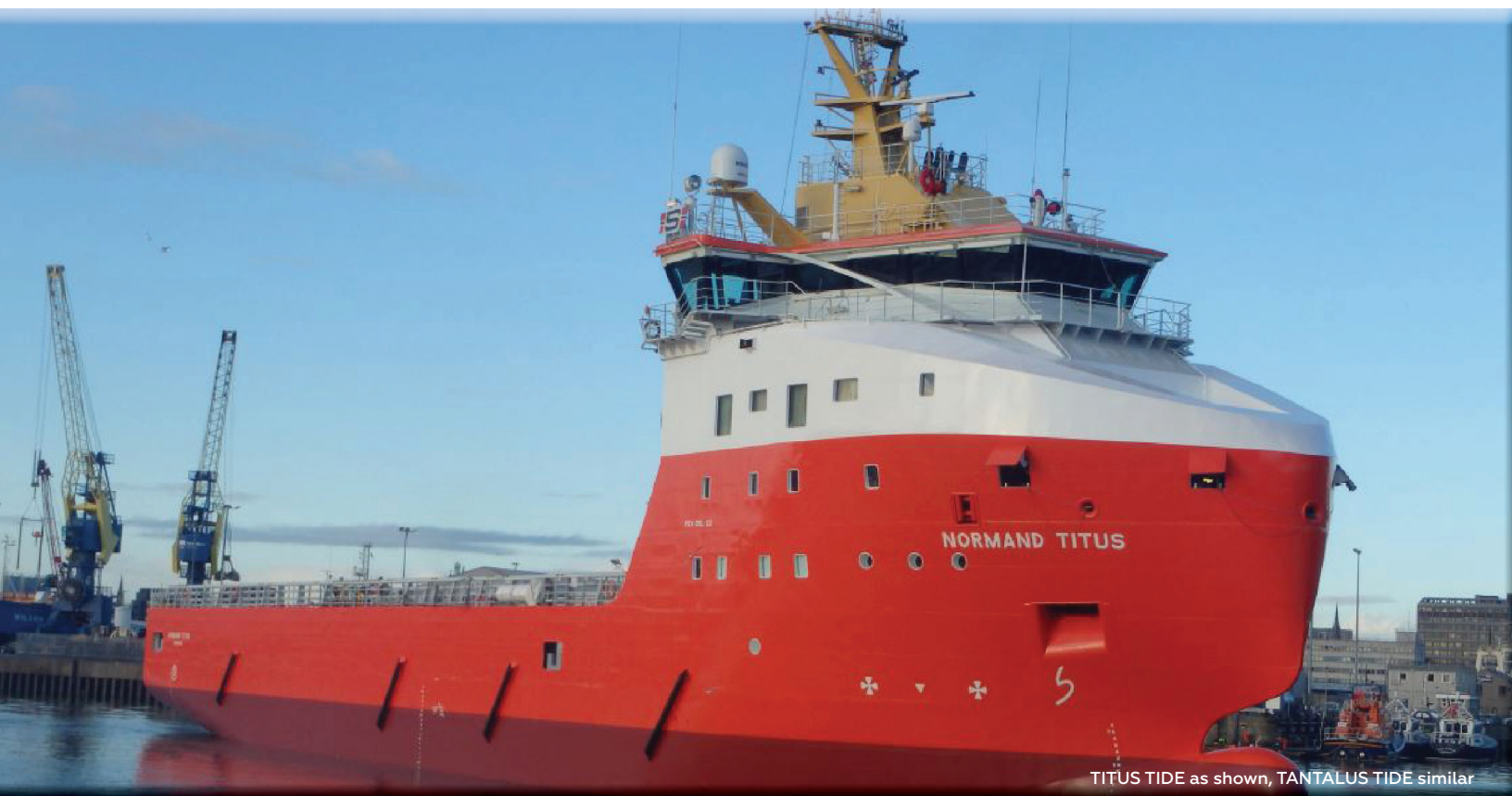
TITUS TIDE as shown, TANTALUS TIDE similar