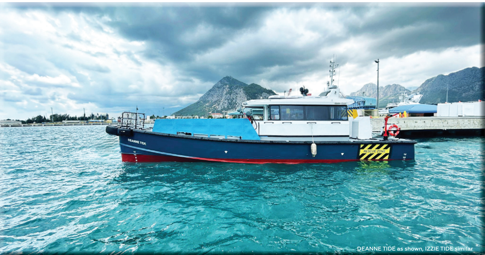
DEANNE TIDE as shown, IZZIE TIDE similar